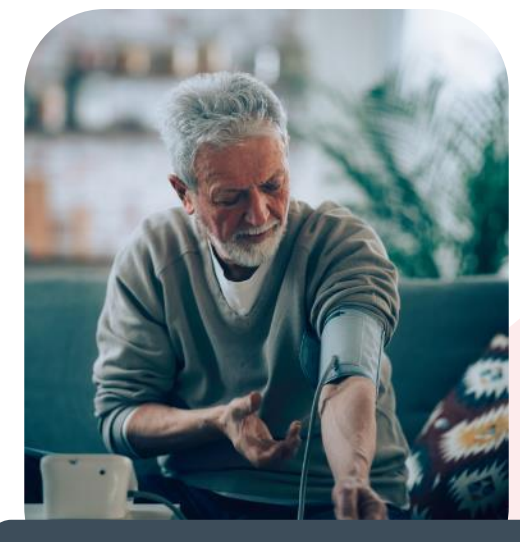
INSIGHT AND COMMUNICATION