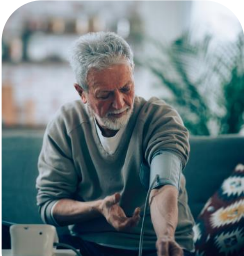
INSIGHT AND COMMUNICATION