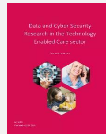
Data and Cyber Security Research for Technology Enabled Care