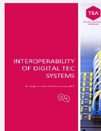
Interoperability of Digital TEC systems