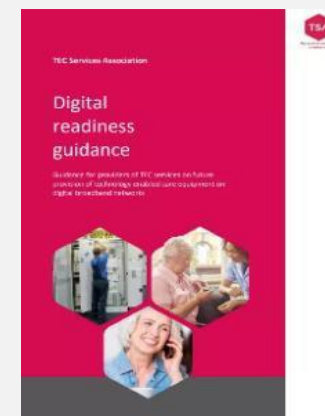
Digital Readiness Guidance