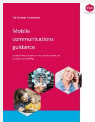
Mobile Communications Guidance