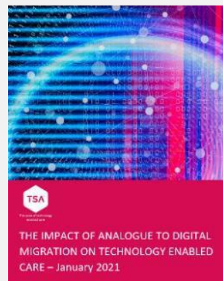
The impact of Analogue to Digital Migration of Technology Enabled Care