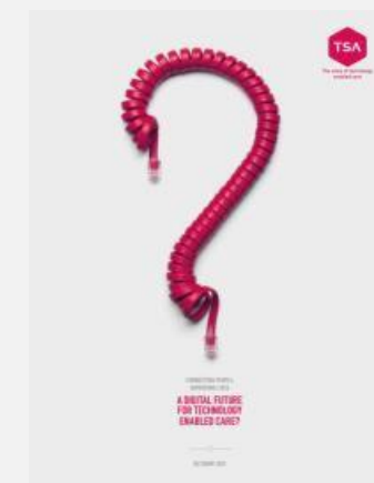
A Digital Future for Technology Enabled Care?