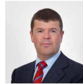
Rt Hon Paul Burstow President, Technology Enabled Care Services Association (TSA)

TEC creates ways to collaborate with domiciliary care, such as by setting up virtual care visits. It also feeds into the wider smart city agenda by utilising data sharing across public services to identify how to proactively support and drive self-care.